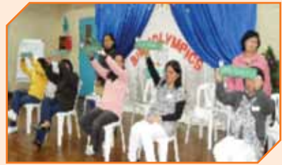
The five Bible Quiz finalists showing their answers during the clincher round...

‘Bibliolympics’ .....This word is a combination of the two words Bible and Olympics. It is what we call the Bible Games held every New Year to encourage everyone to open and read their Bible and to be familiar with the events, characters, places and verses which serve as an armor in our daily Christian living.