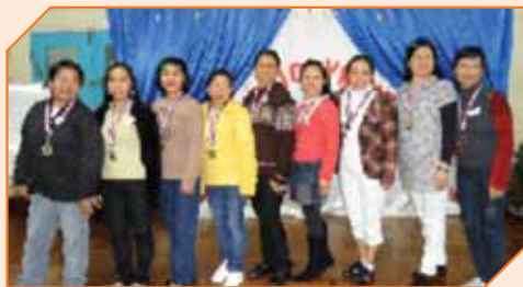
The Bibliolympics 2012 winners of the Bible Quiz, Bible Memory Verses and Bible Drill in their gold, silver and bronze medals...

In the Group Games, the participants were divided into 3 groups and all were encouraged to join in the Bible Pictionary, Bible Actionary, & Bibliohenyo (Bible Genius) All had fun and enjoyed the company of each other. They learned that to win these games, they have to work as a team and to practice coordination, cooperation & discipline.